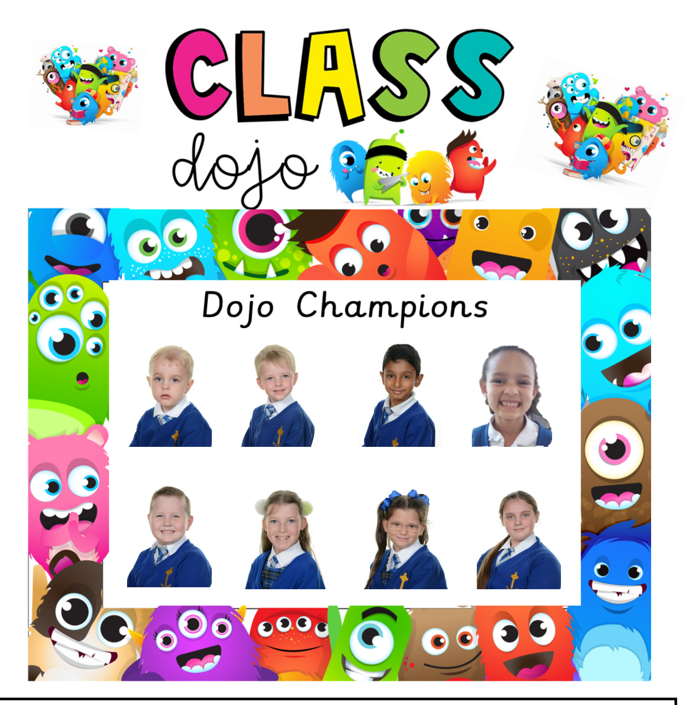
Take a look at our Dojo Champions.